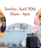
Home goods, small appliances, useful and decorative items