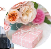
Gifts for Mom, gifts for you, and so much more!