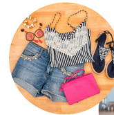
Clothing, purses, jewelry, and shoes for women, men, and kids